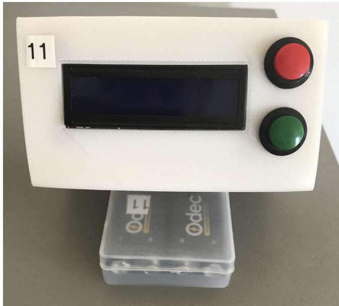
Figure 1. SmartAngels prototype device.

For that, we use two telecommunication networks that are both redundant and autonomous. On the edges of coverage areas, the gateways are connected to reachable public telephone networks (2G/3G/4G/5G?). They allow to communicate in case of emergency. The SmartAngels community actors can take action to provide first aid while waiting for civil protection assistance. Thus, thanks to network meshing, the SmartAngels system ensures an optimal neighbourhood solidarity, and the actors – or first responders – of the system can efficiently help to coordinate emergency management during a crisis. The SmartAngels system allows to overcome technical limits in areas where telecommunication networks are underdeveloped. An example of SmartAngels system architecture is illustrated in Fig. 2.