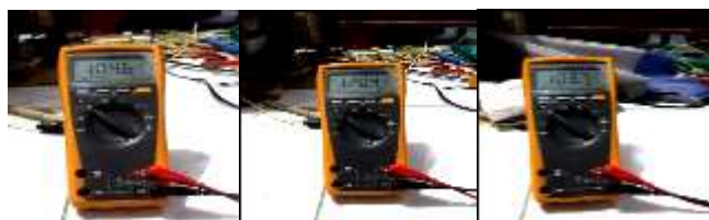
Figure 2.3.1. Result 1 Figure 2.3.2 Result 2 Figure 2.3.3 Result 3

3. What is the significant benefit of Walkergy Pad for an Average Energy House Consumption?