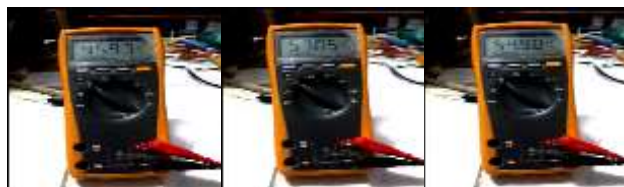
Figure 2.1.1 Result 1 Figure 2.1.2 Result 2 Figure 2.1.3 Result 3