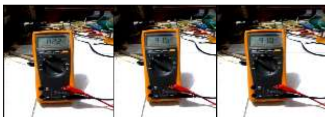
Figure 2.2.1 Result 1 Figure 2.2.2 Result 2 Figure 2.2.3 Result 3