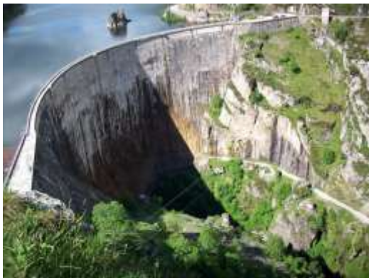
Figure 1. La Cohilla Dam (Cantabria, Spain).

Due to its constructive typology and to the changes in the conditions of the variables that determine its stress state, movements of up to 12 mm are registered in the center of the dam crown. As it counts with the instrumental (pendulum and meteorological station) and the required records, the dam is ideal for the development of this research. Figure 1 gives an idea of the dimensions of this structure, which is an arch dam with an approximate size of 240 m in width and 110 m in height.