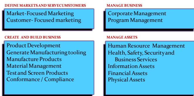
Figure 1: An organization's overall business decomposed into four major segment

The technology will focus on target business process rather than data. This will imply subdividing the enterprise into functional units by seven levels of business hierarchies as shown in the figure below.