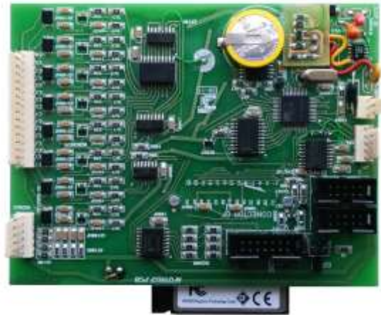
Fig. 1. Photo of the hardware prototype.

where l is the loop length (that it is assumed to be the same for both loops).