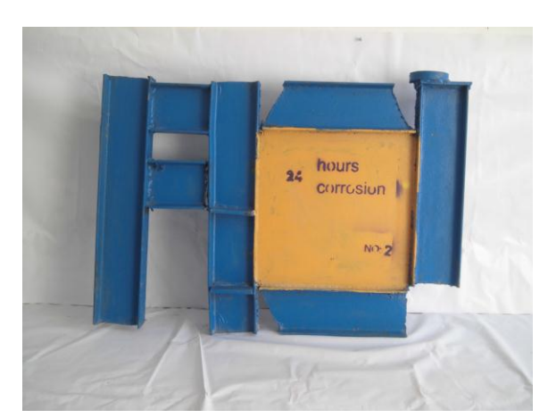
Figure 1. A typical specimen of single SPSW.

Panel members must easily to be exposure to the steam and saltwater and the experimental test must be accomplished in a closed place, the pH level of the solution and temperature of closed place must be set up according to the standard specified test methods. Experimental test carry out and the loss of weight is measured.