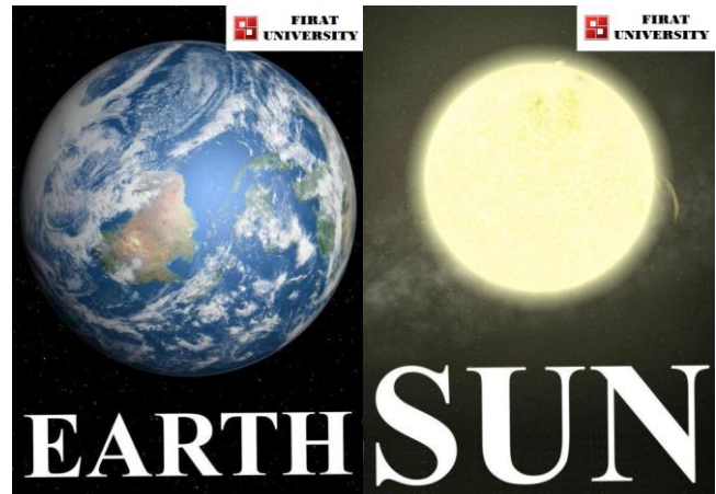
Figure 2 Used Markers

augmented reality application triggering visual learning on any subject. This application is based on adding a virtual content by augmented reality on cards which have been designed as a physical content. The marker cards given as examples are shown in figure 2.