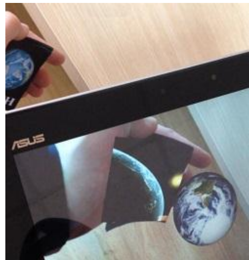
Figure 3 Developed application screenshot

When the application captures the markers with the camera virtual content will be displayed on the screen. 3D Model and video will be located as motion-sensitive to the marker. Within the time in which marker is seen by the application 3D Model and video will be generated on the motion-sensitive screen. An image of the developed application can be seen in Figure 3. If the card or camera angle is changed, 3D model and video can be formed again in a proper angle.