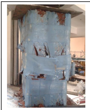
Fig 5 : Failure of GWOA Specimen

In case of GFRP retrofitted columns without anchors, failure occurred by delamination of GFRP horizontal strips from brick masonry surface. In some portion the part of GFRP strip got delaminated along with brick masonry material. Vertical GFRP strips showed fracture but horizontal strips predominantly failed due to delamination which can be seen in Figure 5. In case of specimens with GFRP anchors, more confinement was achieved as the anchors delayed the delamination of horizontal strips and specimen could carry some more load but ultimately failure occurred due to delamination.