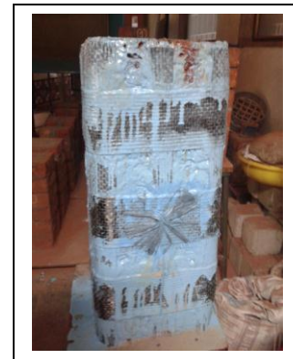
Fig 3 : CFRP with Anchors