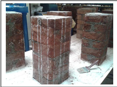
Fig 2 : Marking for FRP strips on Primer applied specimen