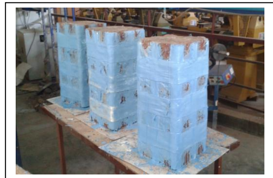
Fig 4 : GFRP without Anchors

Figure 4 shows photograph of GFRP wrapped specimens. All specimens were tested under Universal Testing Machine (UTM) of 100 tonnes capacity for uniaxial compression till failure.