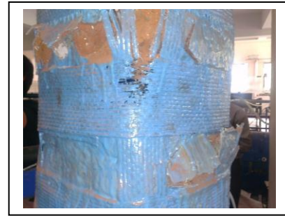
Fig 6 : Failure of CWOA Specimen

CFRP retrofitted specimen in both cases with anchor and without anchor failed by rupture of FRP. The vertical strips got fractured first and the brick masonry inside was crushed completely to powder form. The load was carried by the specimens till rupture of horizontal strip occurred. Figure 6 shows photograph in which rupture of horizontal strip can be seen. The specimen with anchor showed increased capacity as compared with specimens without anchors.