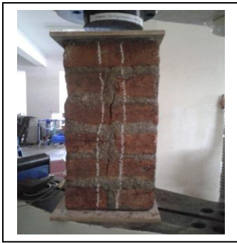
Fig 1 : Vertical Splitting Cracks