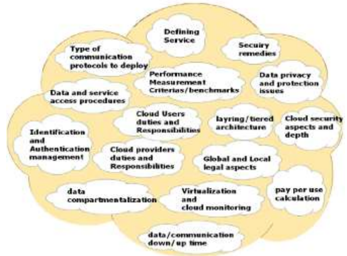
Figure 1. Salient points to consider while drafting SLA

based access and entity-level applications. Proper integration promises better performance. Integration and its way need to be documented and agreed upon by the cloud provider as well as users for reliable implementation and constructing test benches for cloud computing services and security depth. Security depth means the type and extent of security measures that can be used to secure the cloud and its services. [8, 15]