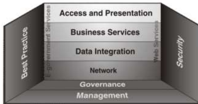
Figure 4. Interoperability Framework of New Zealand E-government [16]

e-government interoperability framework, determining the layers' situation, standards and standard selection procedure (see Figure 4). New Zealand's e-government policy on interoperability includes objective, project and operational management, ruling principles, extension procedures of the e-Government Interoperability Framework (e-GIF) and development of interoperability framework. The results of e-GIF are: satisfaction, convenience, integration, participation and efficiency [16].