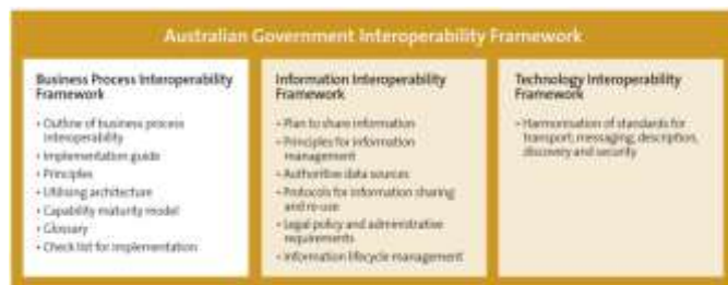
Figure 3. Interoperability Framework of Australian Government [14]

The interoperability framework implemented by the Australian government comprises three domains consisting of business, technical and information interoperability levels (see Figure 3) [14]. The business level of interoperability includes principles, guidelines and tools for establishing and enhancing interoperability. It assists mainly the agencies to devise strategies for executing projects with cross-agency nature. The information level of interoperability framework features those components necessary for supporting an environment in which the product information will be evaluated and controlled by the government as a national strategic asset [14]. This framework includes information management concepts, principles, tools and practices through which successful sharing of information across the governmental organizations and enterprises is confirmed [14].